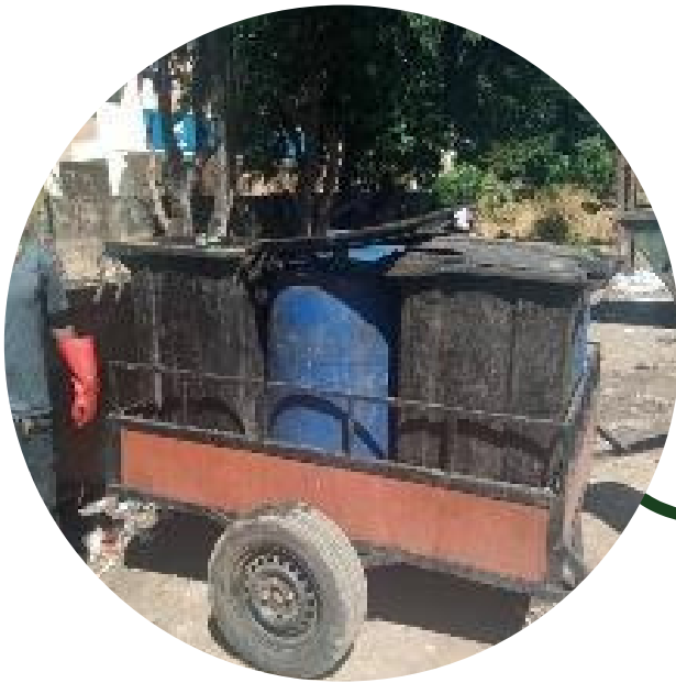
Collection (using zero-emission transport)